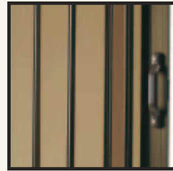
The Visifold gate features a bronze frame with bronze acrylic inserts