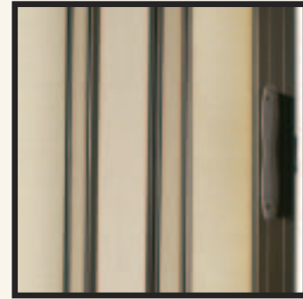
The Panelfold gate includes 3 clear acrylic inserts and simulated ratan inserts